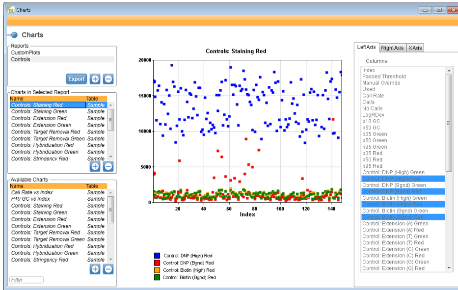
Figure 3: Quality control visualization—Beeline Software generates various charts for visualization of QC performance. Charts can be saved in PDF format for viewing outside of the software.